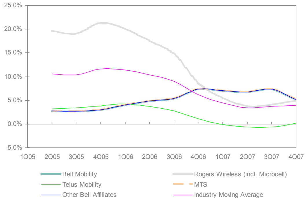
Chart 3: MOU/Sub Growth (1Q05 – 4Q07), %