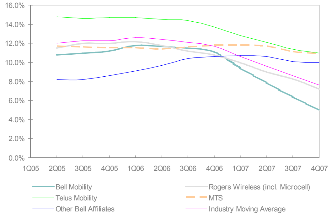
Chart 1: Subscriber Growth (1Q05 – 4Q07), %